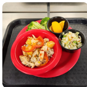
Sweet and sour rice bowl with an Asian inspired slaw.