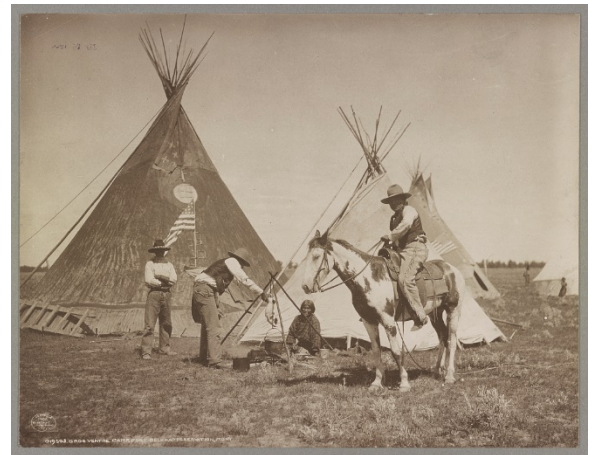
Detroit Publishing Co, P. (1906) Gros Ventre Camp. Fort Belknap reservation, Mont. Montana, 1906. [Detroit, Michigan: Detroit Publishing Co] [Photograph] Retrieved from the Library of Congress.

Historically, Montana was not the homeland of all the tribes located here today. Likewise, there were tribes such as the Shoshoni and other bands of Chippewa in this area that are no longer here. As settlers moved into the eastern United States, eastern tribes were pushed west. Eventually, this brought new tribes and settlers into the area, displacing other tribes along the way. To contextualize this rapidly changing cultural and political landscape, one significant non-Indian presence in what is now Montana was the Lewis and Clark expedition in 1805, only a little over 200 years ago, and the first treaties between the federal government and tribes in this area were signed in the 1850s.