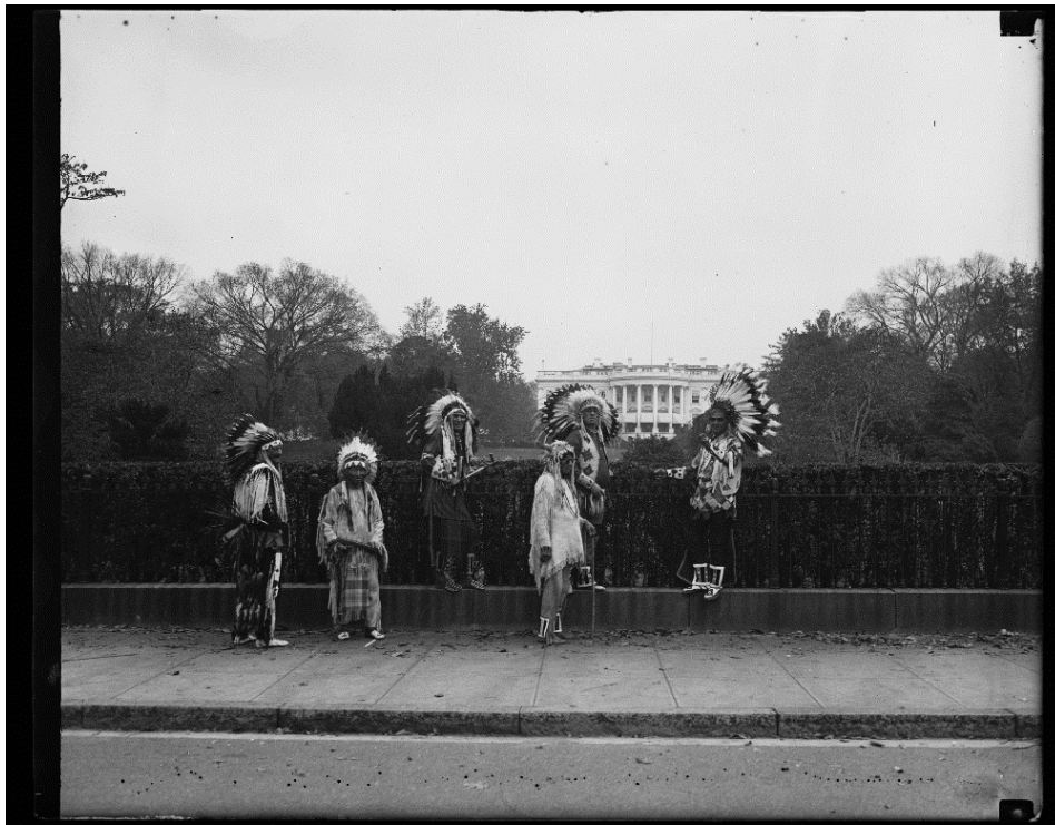
Delegates of the Confederated Salish and Kootenai Tribes of the Flathead Indian Reservation standing outside the White House as they visit Washington to be the first tribe to submit a constitution under the Wheeler-Howard Act (1935). [reproduction number LC-HC-B-8426].