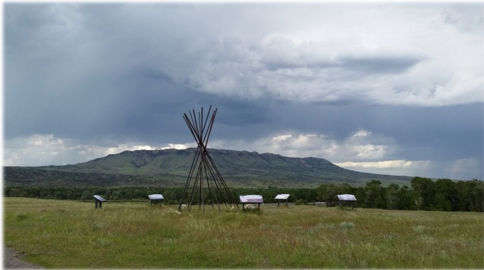
Fort Parker site of the original Crow Agency just outside Livingston, near the Crazy Mountains where Crow Chief Plenty Coup had a powerful vision. Sheep Mountain is in the background.

By giving students the opportunity to view our past through the eyes of many, they can begin to create their own view of our collective history, understand the present, and become better prepared to engage the problems of the future.