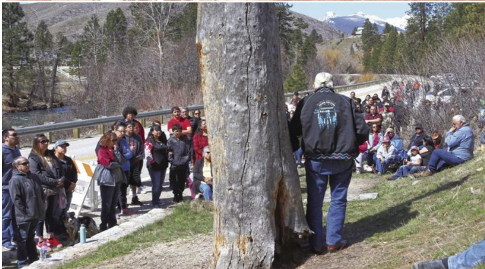
Salish at Medicine Tree (1923)