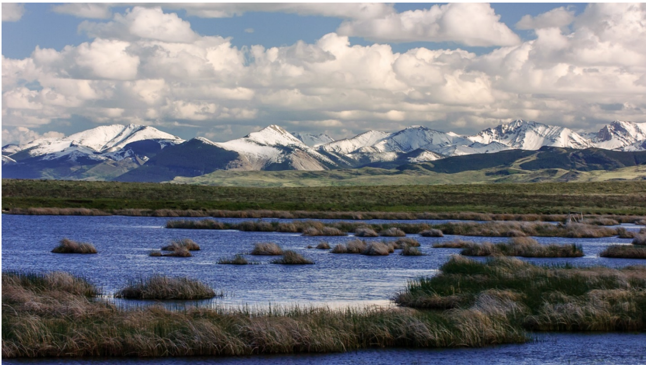
Badger Two Medicine. A glimpse of the “backbone of the world.”

“In the settler mind, land was property, real estate, capital, or natural resources. But to our people, it was everything: identity, the connections to our ancestors, the home of our nonhuman kinfolk, our pharmacy, our library, the source of all that sustained us. Our lands were where our responsibility to the world was enacted, sacred ground. It belonged to itself; it was a gift, not a commodity, so it could never be bought or sold. These are the meanings people took with them when they were forced from their ancient homelands to new places. Whether it was their homeland or the new land forced upon them, land held in common gave people strength; it gave them something to fight for. And so – in the eyes of the federal government – that belief was a threat.” 11