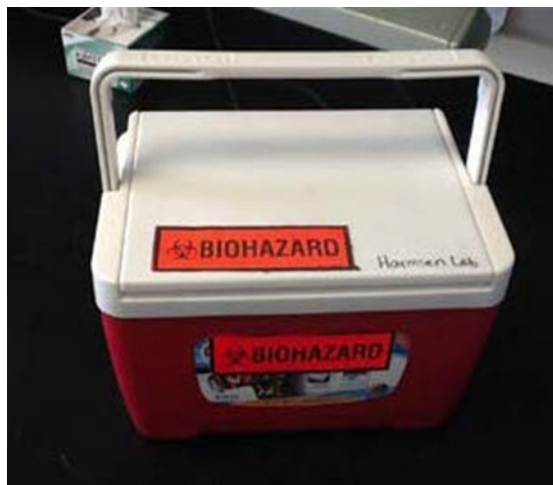
Fig. 2. Labeled, sealed, shatter-proof container for transporting agents between buildings.