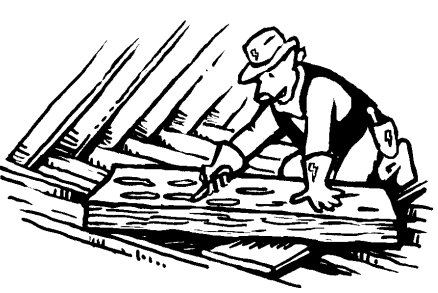
IF YOU INSTALL ADDITIONAL INSULATION, IT SHOLD BE UNFACED—OR USE A KNIFE TO FREELY SLASH THE VAPOR-BARRIER TYPE

insulation. Or you can purchase batt insulation with a kraft paper or foil vapor barrier attached. Be sure to install this type of vapor barrier closest to your living space.