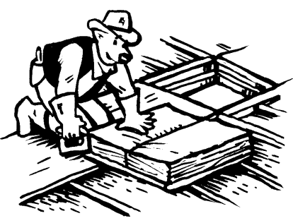
Weatherstrip your attic hatch door as you would any outside door.

loose-fill or vice versa. Just make sure that the new insulation doesn't have a vapor barrier, which would trap moisture inside the old insulation. (More on that later)