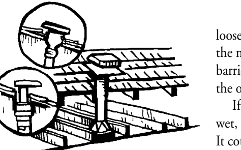
BATHROOM AND KITCHEN VENTS SHOULD BE VENTED THROUGH THE ROOF— NOT INTO THE ATTIC.

1. Be an Attic Detective. Go up into your attic with a flashlight and a dust mask to investigate. CAUTION! If you find vermiculite insulation in your attic, DO NOT PROCEED. Since Vermiculite may contain asbestos, always have it tested before continuing. Construct a makeshift walkway by laying boards on top of the joists, because the ceiling below won't support your weight. Measure the amount of insulation present and determine its type—it's most likely mineral or rock wool, glass fiber or cellulose fiber. You can take a sample to your Extension office or building materials supplier if you are unsure. If there is already insulation up there and it's dry and evenly spread out, you can leave it alone and add more insulation on top if needed. You can put batt insulation over existing