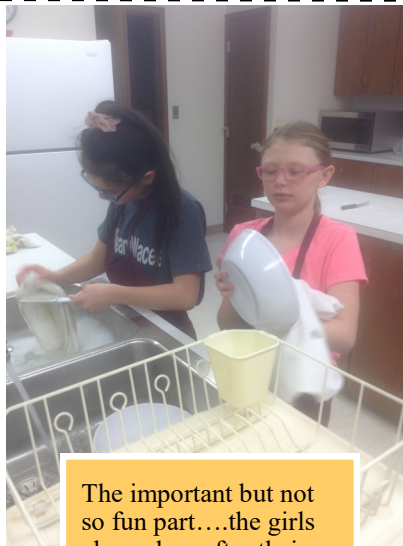
The important but not so fun part...the girls cleaned up after their project meeting