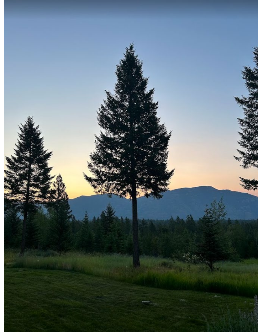
Columbia Falls, MT