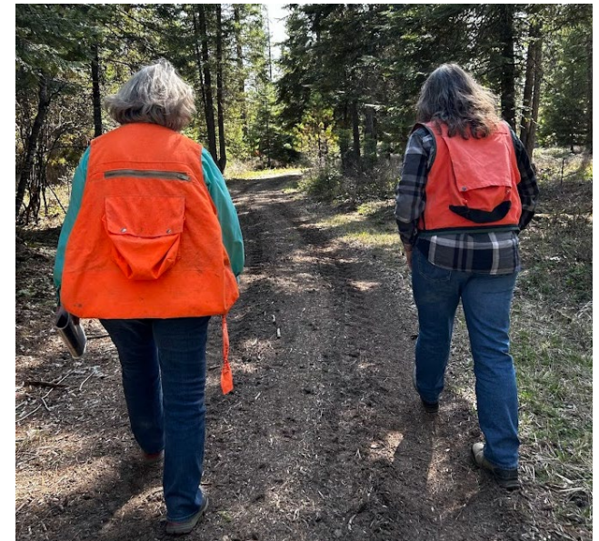
2024 Workshops