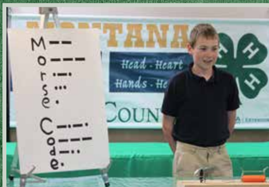
Draw interest with a clear and creative title poster.