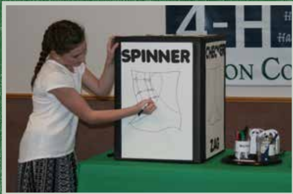
Use a covered box as a visual aid and flip sides.