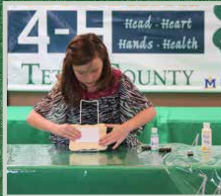
If possible, tilt work surface toward audience.