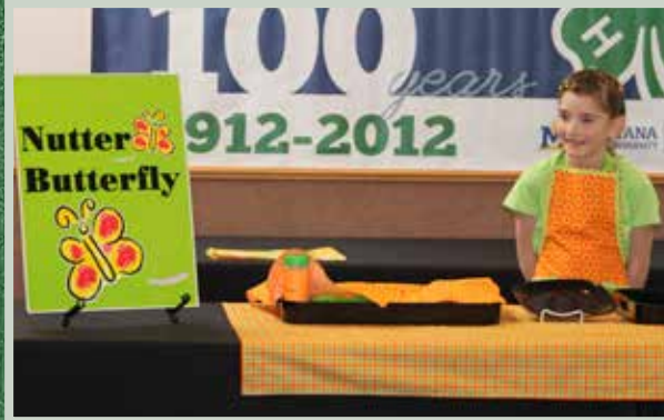
Posters should be a size that the 4-H youth can manage. Think about color coordinating supplies, posters, etc