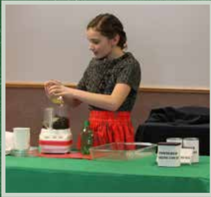
Use trays to organize supplies, cover brand names, use a cloth to cover dirty supplies, have finished product covered on back table until revealing.