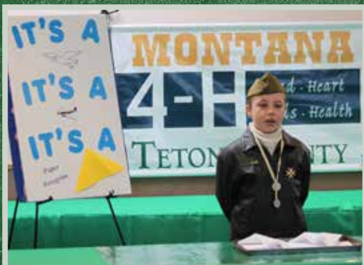
Costumes can be used to enhance a presentation.