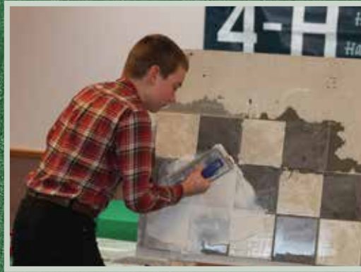
Use an easel so work can be shown to audience. Do not talk with back to audience. Show the step and turn back around to talk.