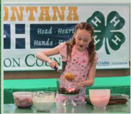
Use clear cookware when possible, and keep work surface clean and clear.